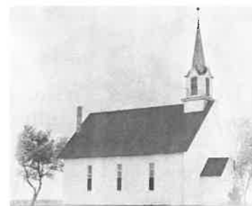
Bethany Lutheran Church Story City, Iowa

A congregation near Story City, Iowa, has been organized and is served by visiting pastors of the Norwegian Synod.