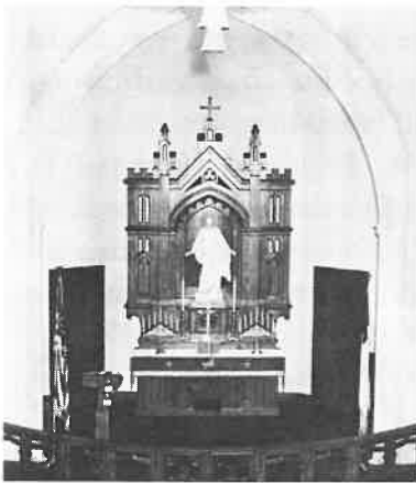
Fairview Lutheran Church

The ladies of the Fairview congregation deserve the sincerest thanks of the convention of their untiring efforts in providing the meals for all who desired these in the parlors of the church. The fact that the members could spend the recess hours together at and about this beautiful church added very much to the pleasure and comfort of all in attendance.