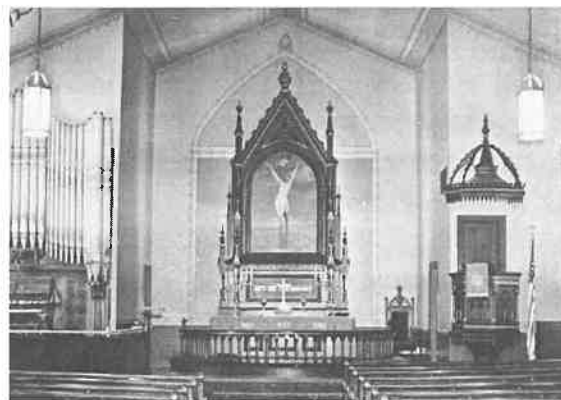
Hartland Lutheran Church, Hartland, MN

A small congregation nine miles from Fertile, Minn.,