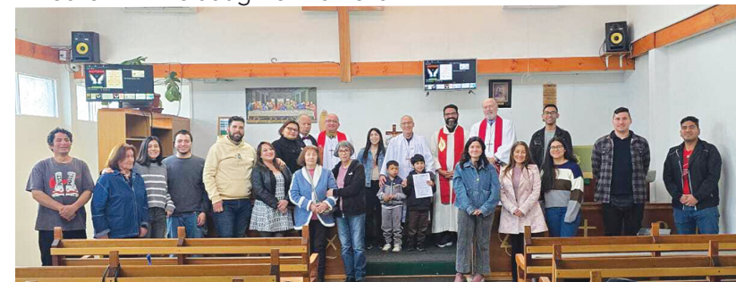
▲ the congregation