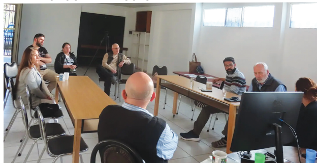
▲ panel discussion

One such example of this was a panel discussion put together for us visiting pastors. Questions were prepared for us so that we could respond from scripture and experiences. It was a pleasant experience with questions ranging from practical questions to questions of how we are to continue applying the Scriptures and Lutheran confessions in our everyday lives.