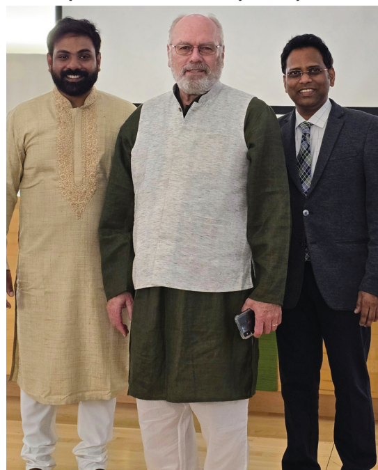
LMSI presentation at WLS seminary ▲