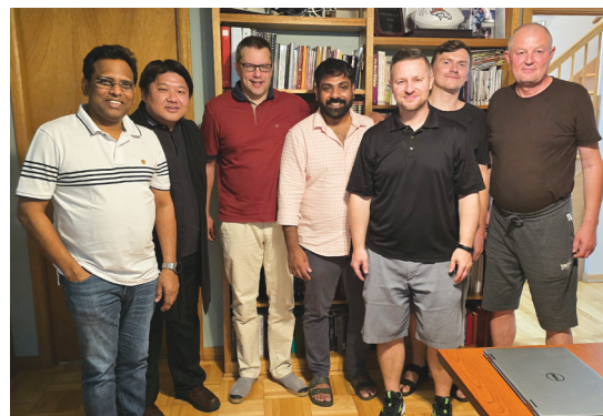
Week One International Educators ▲

Additionally, I am deeply thankful for all the care and support provided during our stay at Wisconsin Lutheran Seminary. From the daily chapel services that nourished our souls to the various get-together events