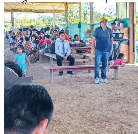
▲ guests at the reception