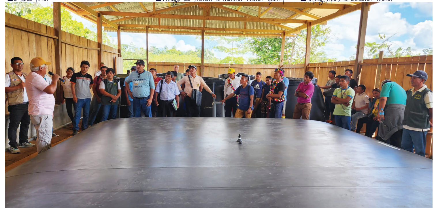
▲ the large bladder where bio-purification takes place