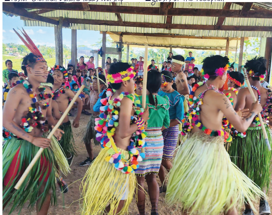
▲ traditional dance to celebrate the occasion