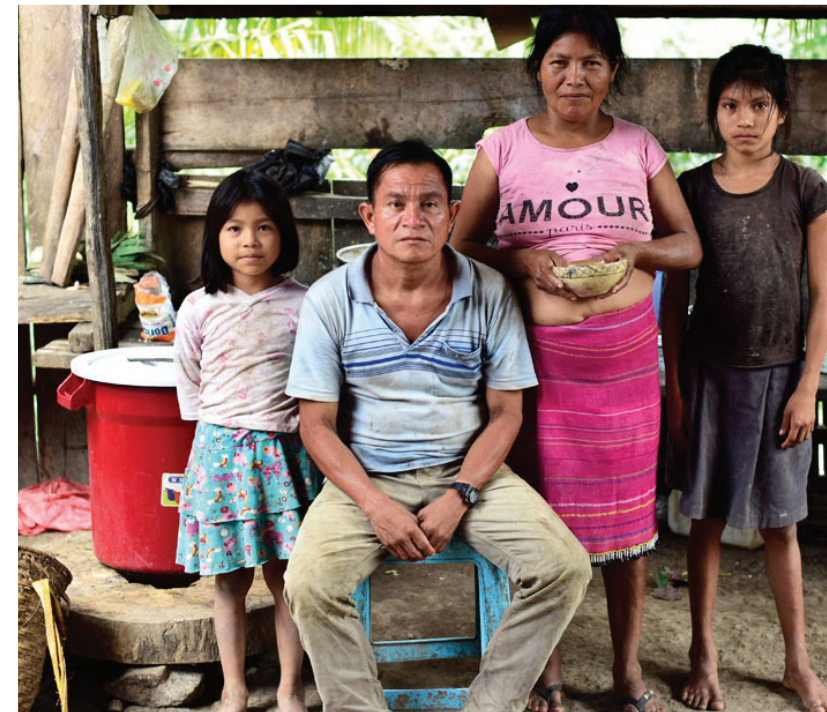
▲ clean water will mean healthier families and children