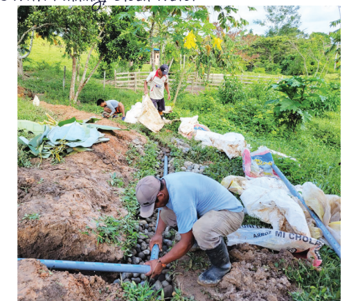
▲ laying pipes to conduct water