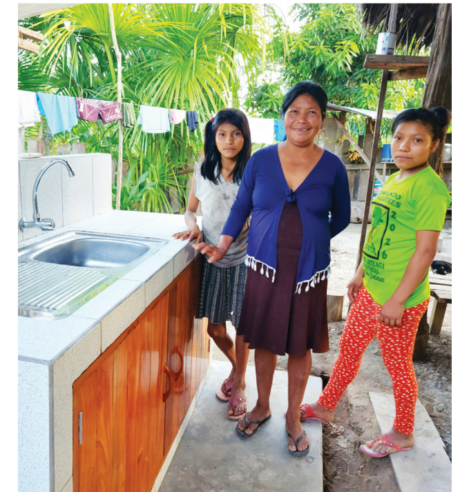
▲ a new sink with running, clean water