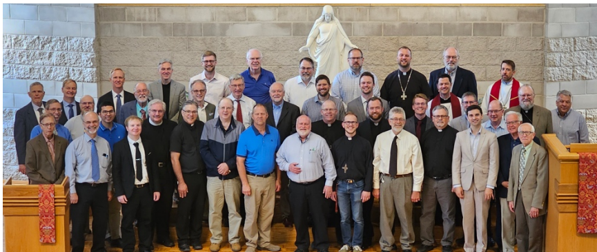
Clergy from Minnesota and Iowa gathered for the Great Plains Pastors Conference on May 24th on the campus of Bethany Lutheran College.