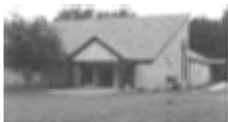
Ascension Lutheran Church

Grace Lutheran Church, Hobart, Indiana, celebrated its 10 th anniversary on March