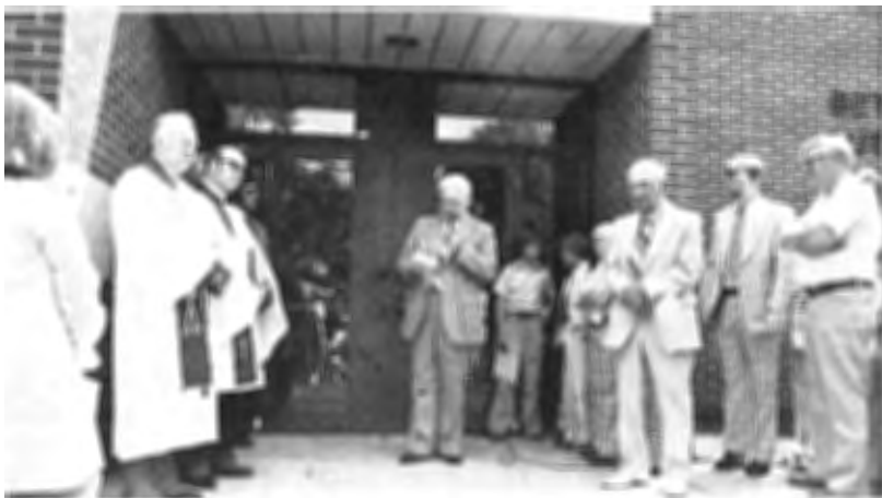
Dedicatory prayer at Seminary door