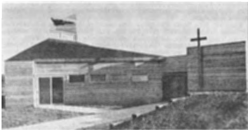
Bethany Lutheran Church Ames, Iowa

Also on June 26, 1977, Bethany Lutheran Church of Ames, Iowa, dedicated its