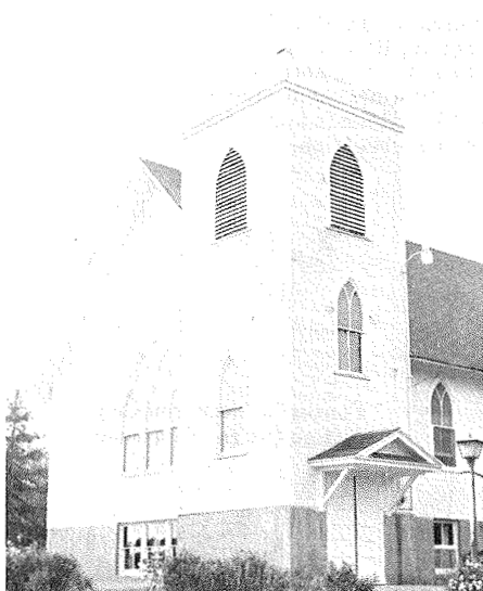
Our Savior's Lutheran Church New Hope, Wisconsin