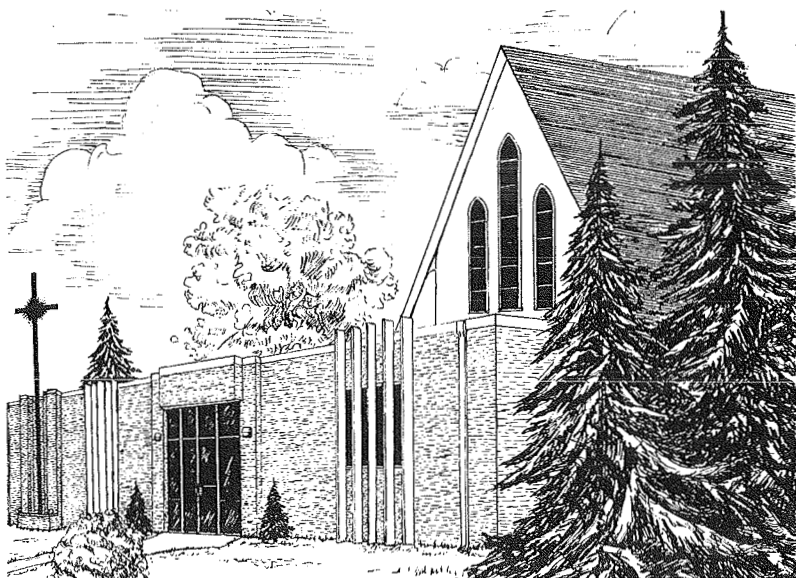
Mt. Olive Lutheran Church Mankato, Minnesota

Others who are observing anniversaries of their ordination into the holy ministry this year are the following: