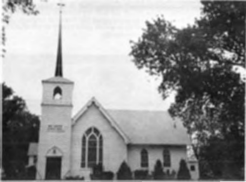
St. John's Lutheran Church Cedar Rapids, Nebraska