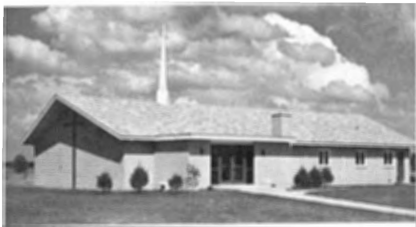
St. Paul Lutheran Church Clintonville, Wis.