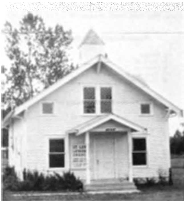
St. Luke Lutheran Church Mt. Vernon, Washington