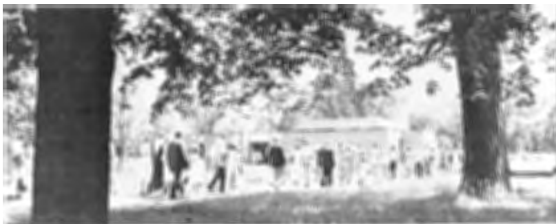
Crowd approaches seminary for key ceremony