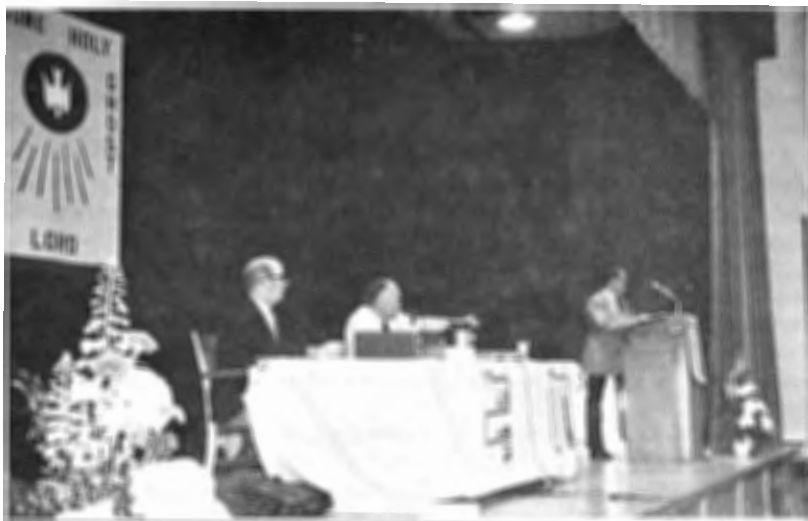
Convention in session

In this time of a false theological emphasis on the work of the Holy Spirit, the theme of the 61st Annual Convention of the Evangelical Lutheran Synod was very appropriately the words of Luther's hymn: "Come, Holy Ghost, God and Lord!"