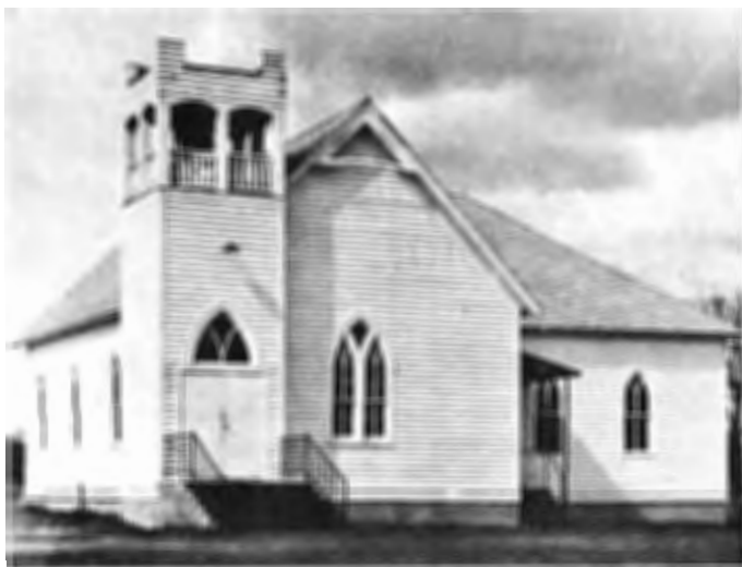
Our Savior's Lutheran Church Ebro Corner, Minn.