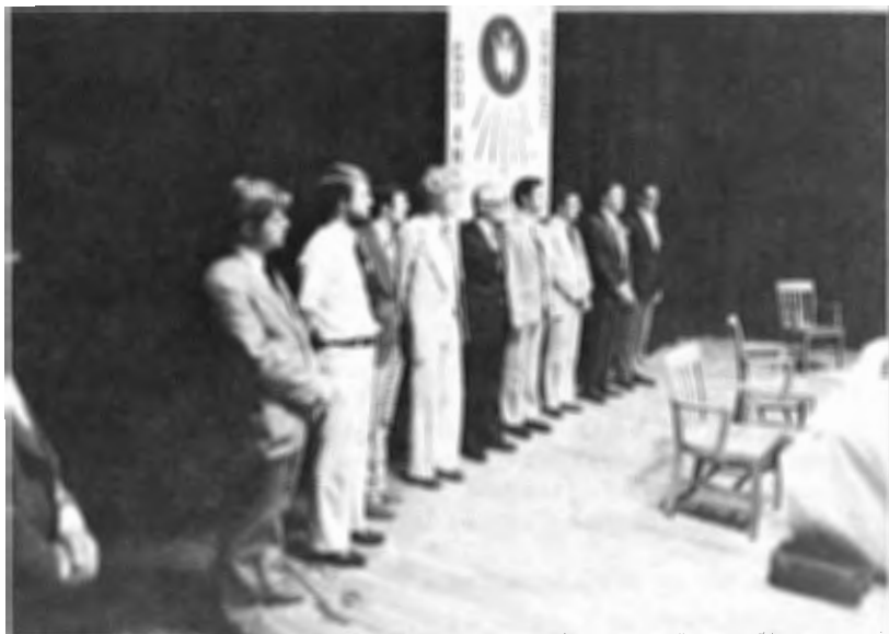
Pastors and Delegates of congregations received into membership