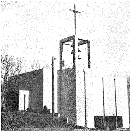
Concordia Lutheran Church Eau Claire, Wisconsin