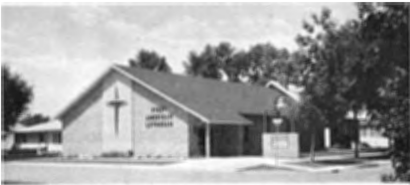
First American Lutheran Church