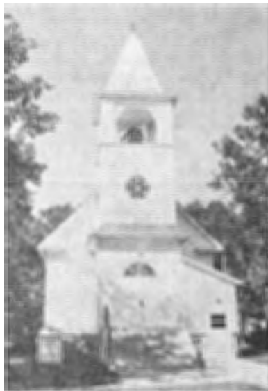
First Evanger Lutheran Church, Fertile, Minnesota