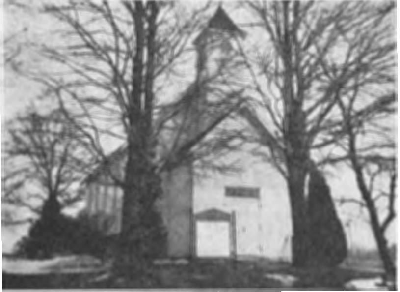
Holton Lutheran Church, Holton, Michigan