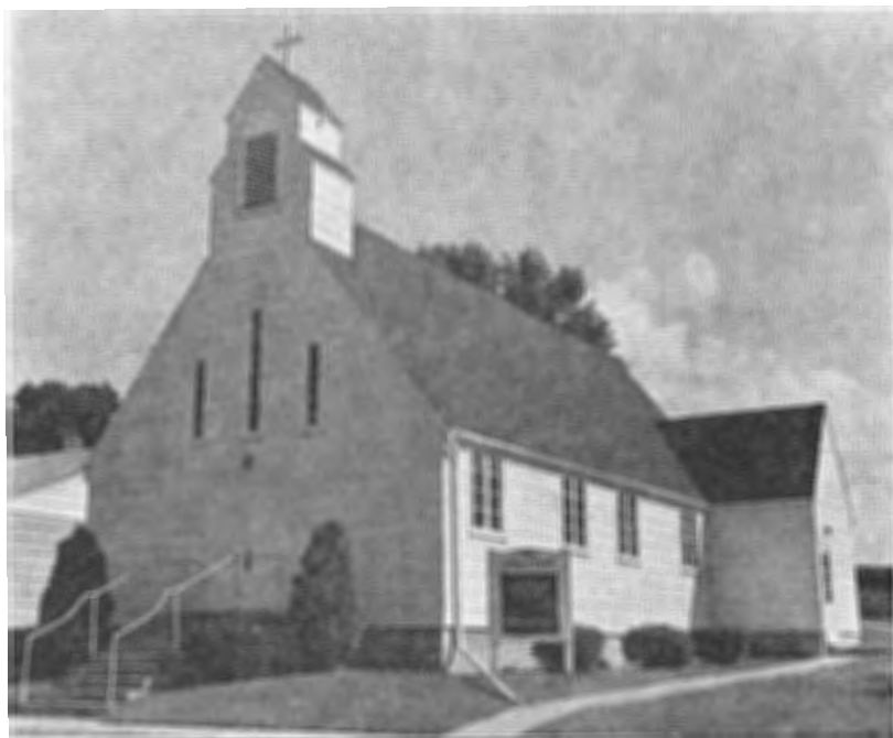
Trinity Lutheran Church, Calmar, Iowa