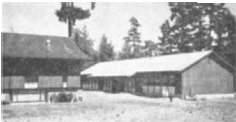
Lakewood Evangelical Lutheran Educational Unit, Tacoma, Washington