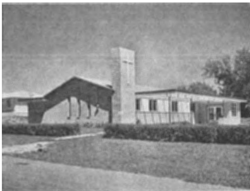
Central Heights Lutheran Church, Mason City, Iowa