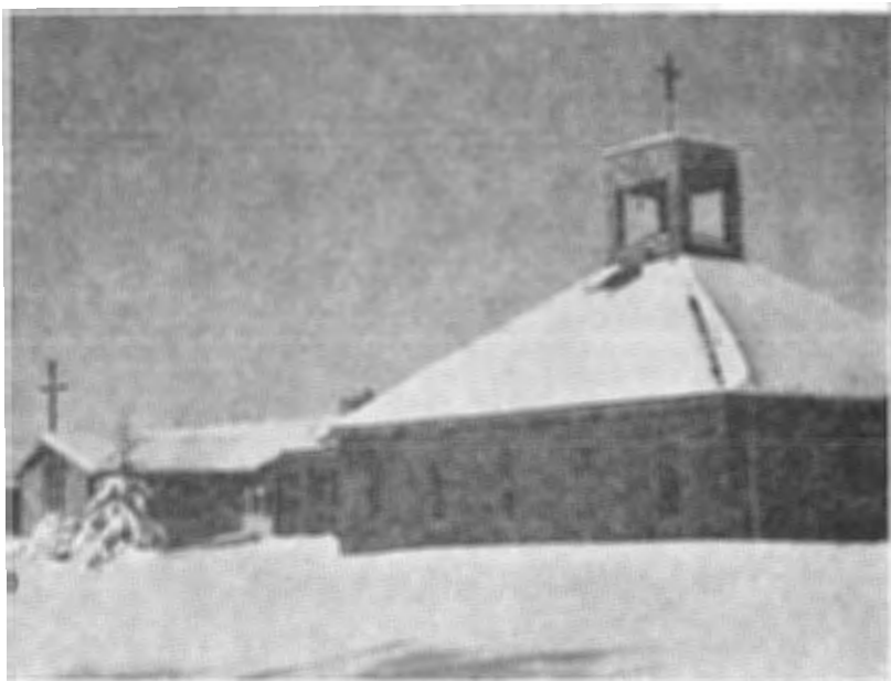
River Heights Lutheran Church, East Grand Forks, Minnesota