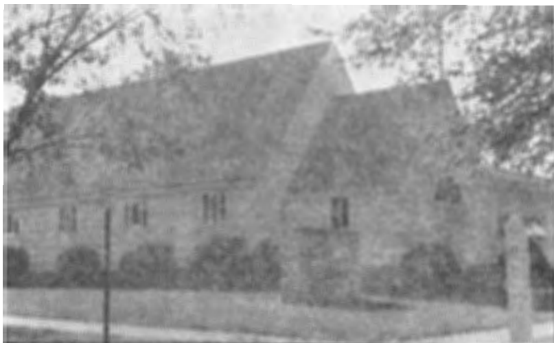
Bethel Lutheran Church, Sioux Falls, South Dakota