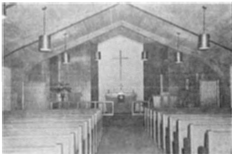
St. Paul's Lutheran Church Sanctuary, Clintonville, Wisconsin