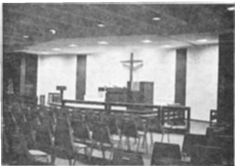
King of Grace Lutheran Church, Minneapolis, Minnesota