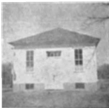
Norseland Christian Day School, St. Peter, Minnesota

the past 40 years has been operated by a private association within the congregation.