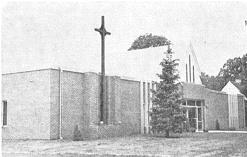
Mt. Olive Lutheran Church and School, Mankato, Minnesota