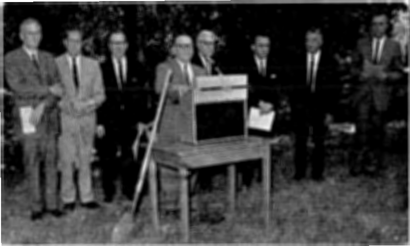
Groundbreaking for the new library at Bethany Lutheran College