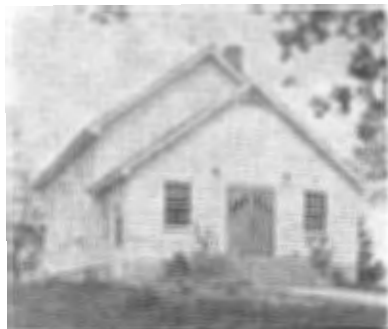
Above: St. Paul's Lutheran Church Lewiston, Wisc.