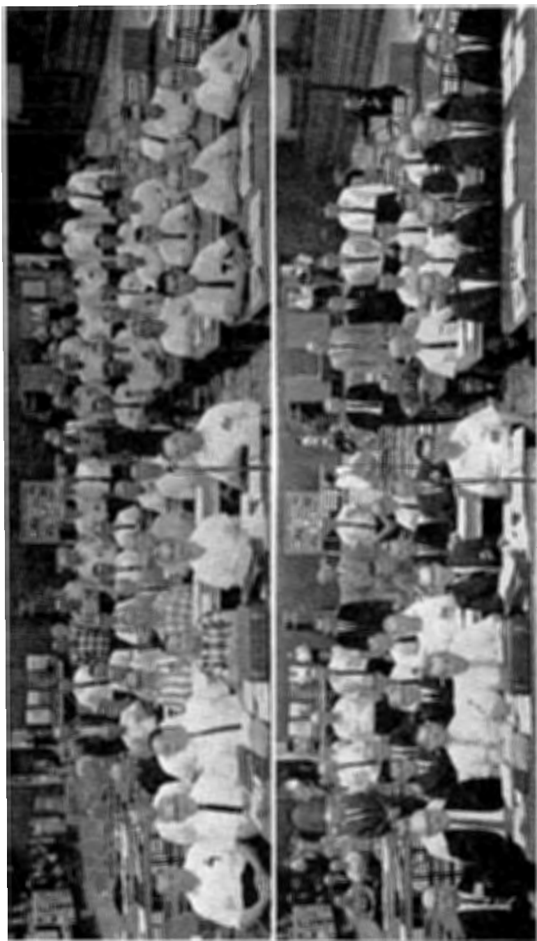
DELEGATES AND PASTORS AT THE 1966 CONVENTION