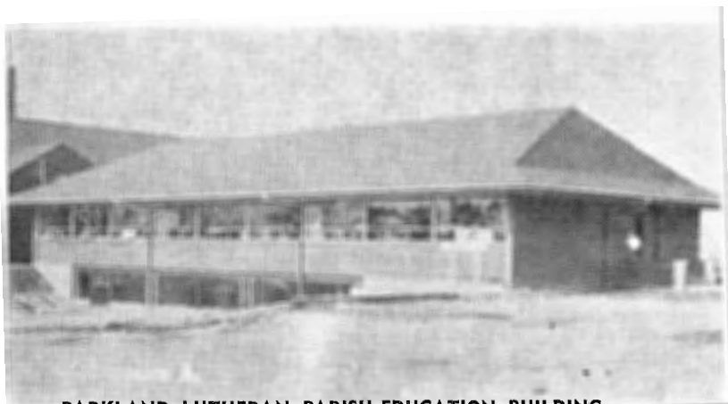
PARKLAND LUTHERAN PARISH-EDUCATION BUILDING