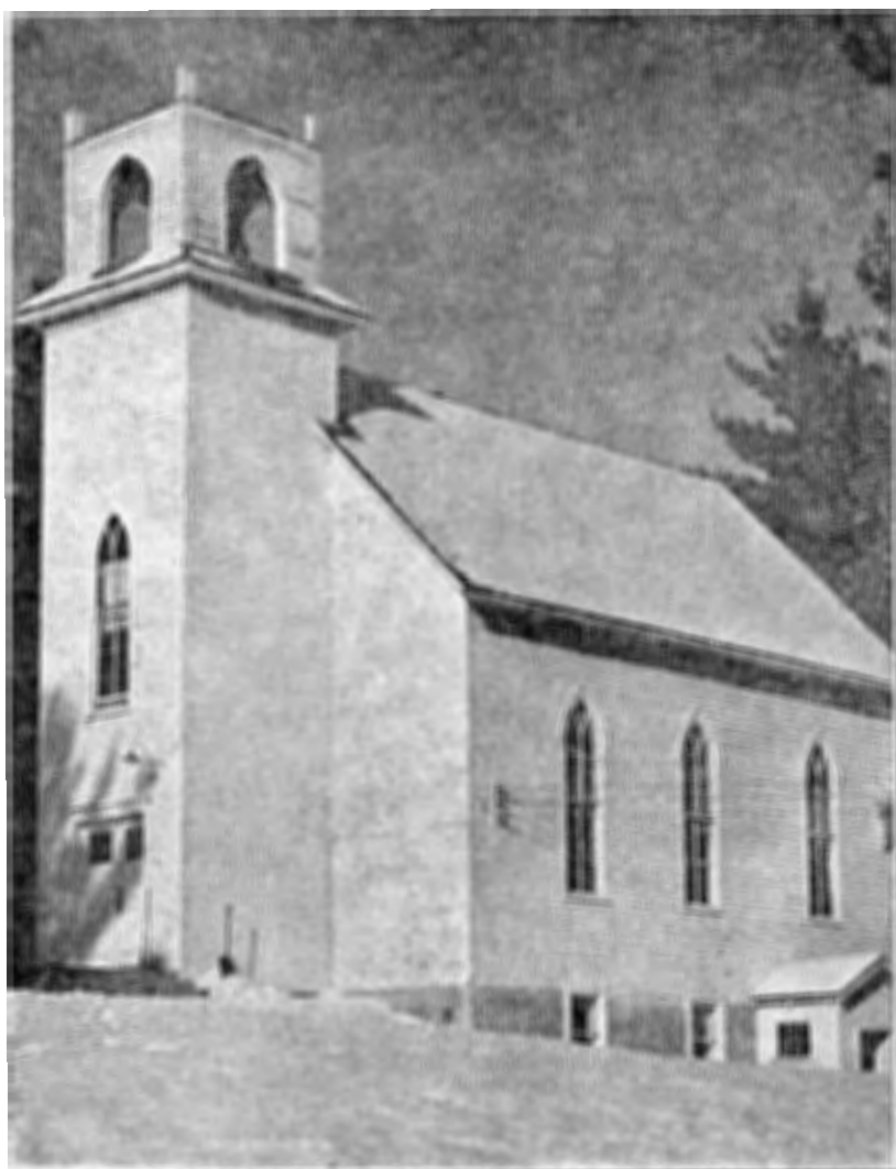
ST. PAUL'S EV. LUTHERAN CHURCH, LENGBY, MINNESOTA