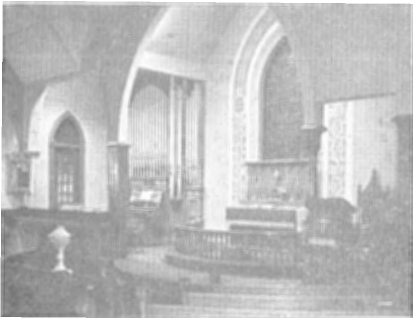
Our Saviour's Lutheran Church, Madison, Wisconsin, celebrated its 75th Anniversary.