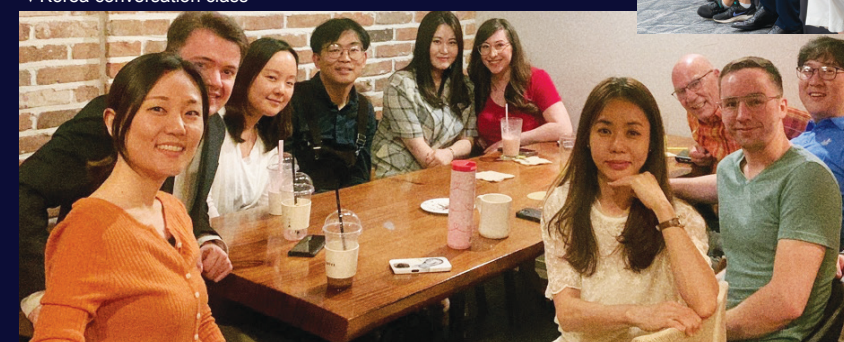
▼ Korea conversation class