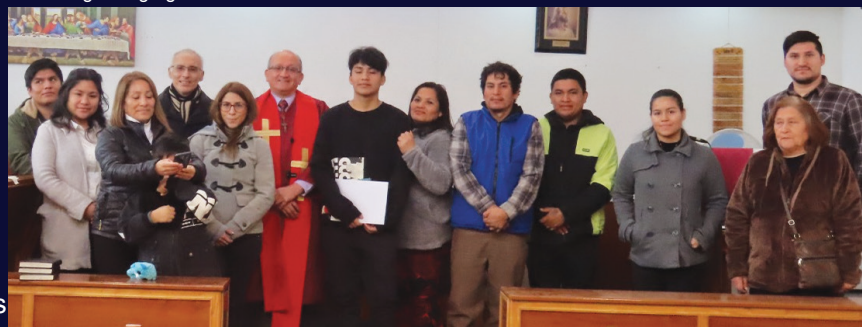
▼ Santiago congregation members

Board of Directors of the Evangelical Synod of Peru