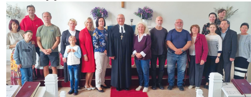
▼ Ozolnieki congregation members