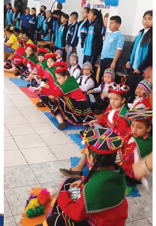
▲ School children program