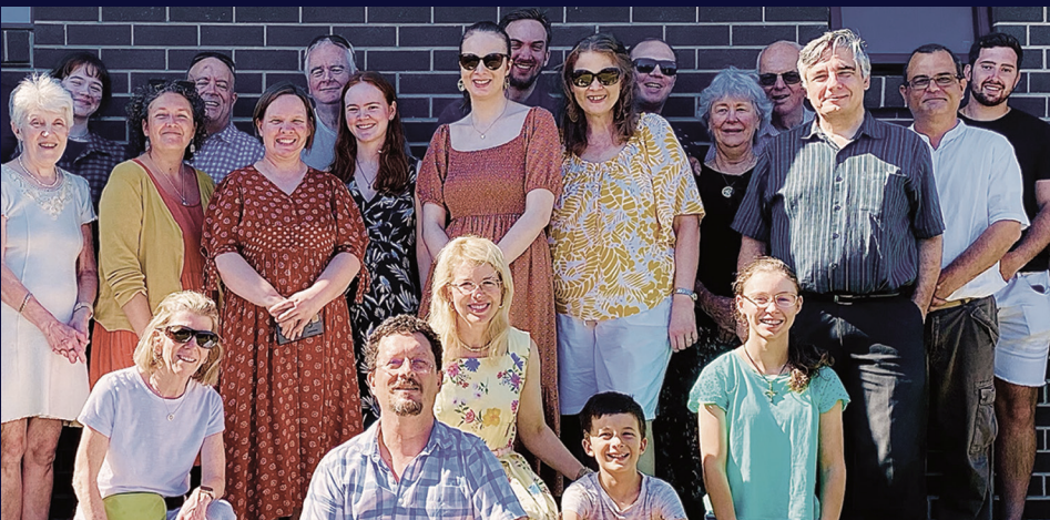
▲Our Redeemer members and friends

Our Redeemer Lutheran Church, Brisbane, Queensland, became a partner church of the Board for World Outreach at last summer’s synod convention. We look forward to working with them as they reach out to their friends and neighbors with the Gospel of Jesus Christ.