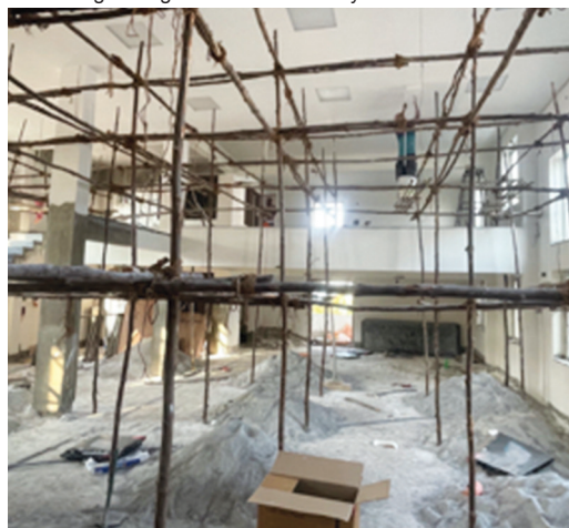
▼ Painting and lights in new sanctuary

We appreciate the guidance and support of the ELS and the BWO and prepare to dedicate this building to the glory of God in January 2024. A little work remains, so we ask you to kindly pray and support this work as we look forward to its dedication. In addition, on this big day we will ordain our second group of seminary students to be pastors.