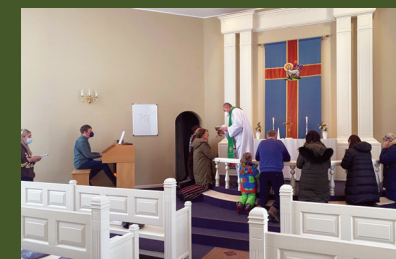
Kekava congregation ▲