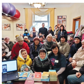
Bible study Ternopil ▲