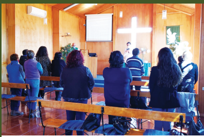
Congregation at Linares ▲