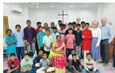
St. Peter's Lutheran Church, Hyderabad ▲