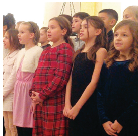
Advent program ▲