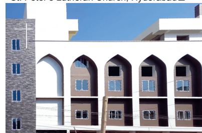
exterior of St. Peter's Lutheran Church ▲

[Hyderabad District] By God’s grace and by your prayers and support, the Lutheran Mission of Salvation-Hyderabad was able to continue its work in the land of a million idols after COVID subsided completely.