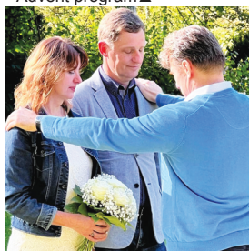
Marriage blessing ▲