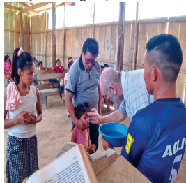
Taiwan baptism ▲