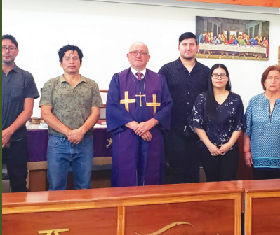
Congregation at LaCisterna ▲

Chile ▶ In 2022, the congregations in Chile were blessed with a full-time pastor who could dedicate his pastoral work to “United by Faith” in Linares and “Family of God” in La Cisterna. Separated by 218 miles, services were held on Saturday mornings in Linares and Sunday mornings in Santiago. We also were able to reach many corners of the world with our online services.