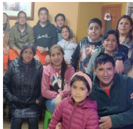
Cajamarca group ▲