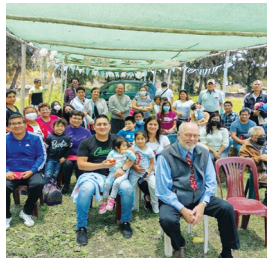
Chimbote outdoor service ▲

world mission field recaps continue on the next pages ►