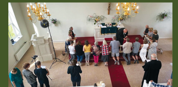
Ozolnieki congregation ▲