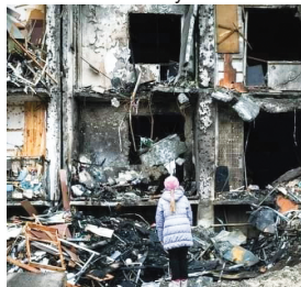
Missile strike, Kyiv ▲