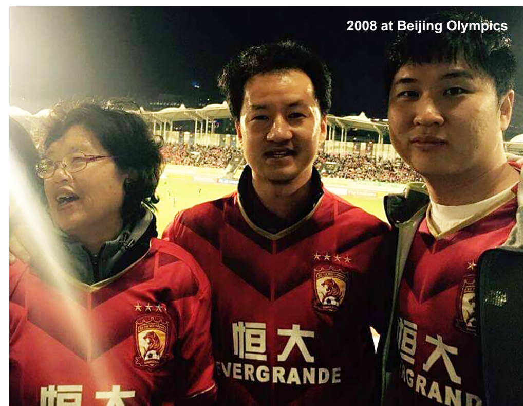
2008 at Beijing Olympics