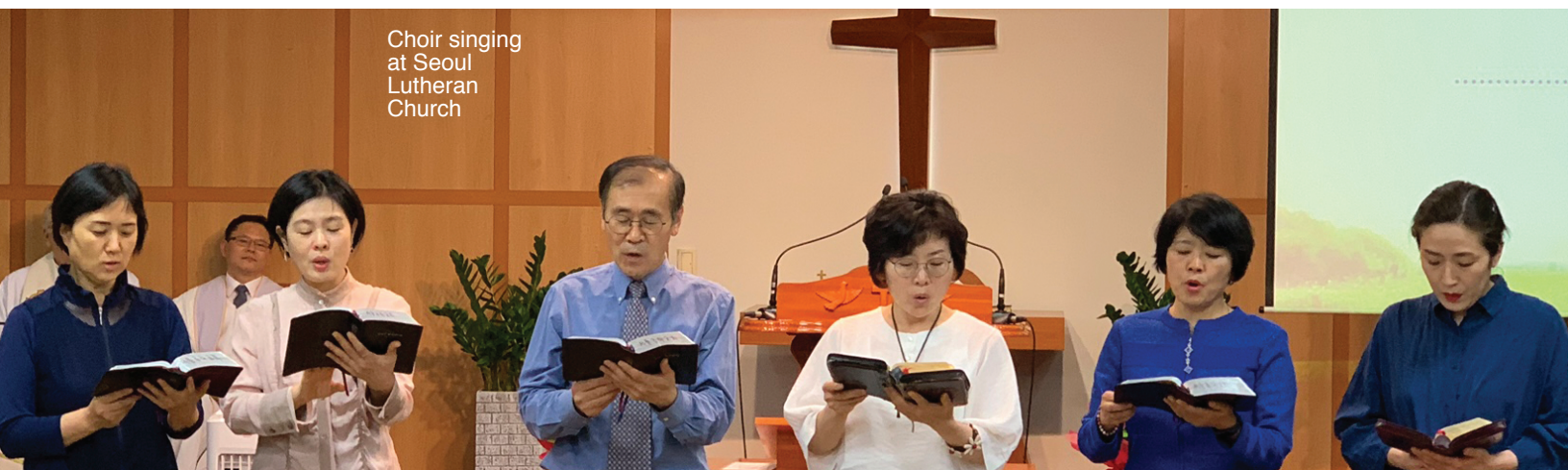
Choir singing at Seoul Lutheran Church