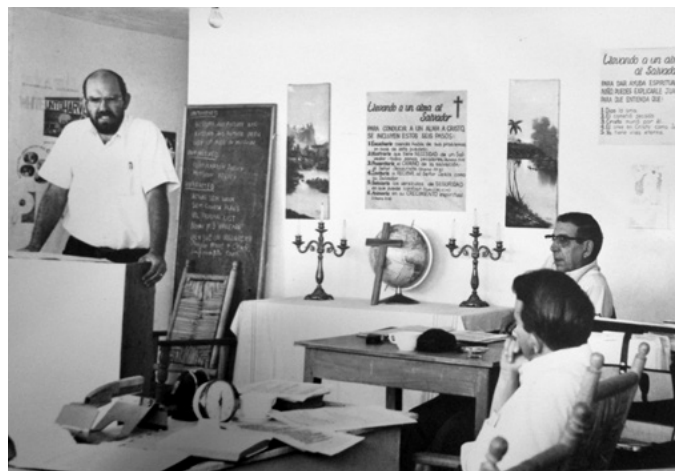
Latin American Missionary Conference, 1974