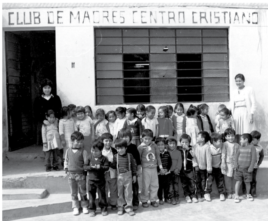
Children and teachers; Año Nuevo Preschool (Mothers' Club), 1985