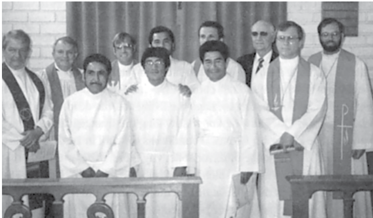
The First Graduates of the Seminary Lima, Peru, 1991