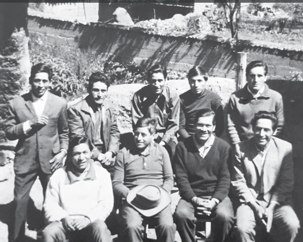
Leaders of the congregation in Pacllón, 1973