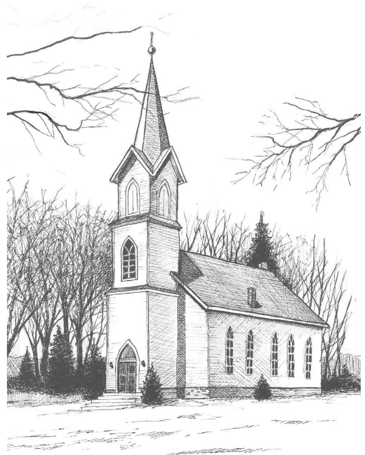
Lime Creek Lutheran Church | Lake Mills, Iowa

FREU DICH SEHR Trente quatre Pseaumes de David , Geneva, 1551 Setting : J. S. Bach, 1685–1750