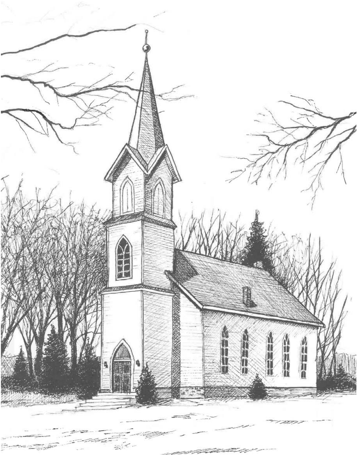
Lime Creek Lutheran Church | Lake Mills, Iowa

Prepared by the ELS Worship Committee and ELS Centennial Committee