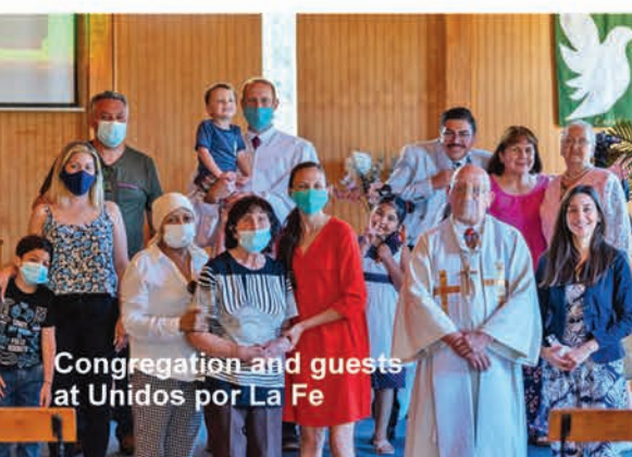
Congregation and guests at Unidos por La Fe